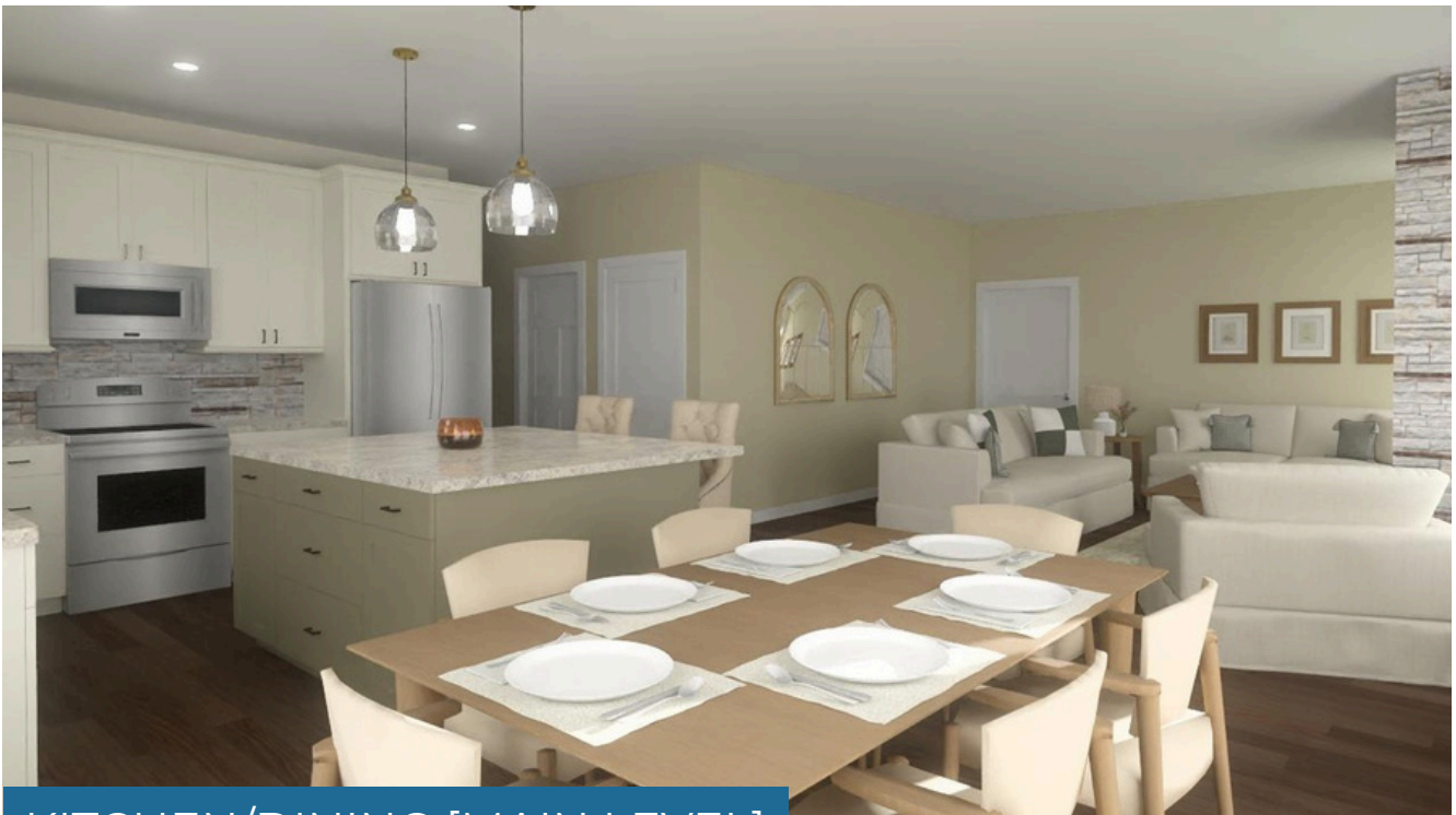
KITCHEN/DINING [MAIN LEVEL]