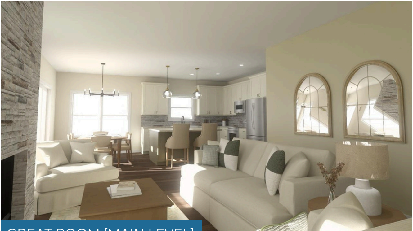
GREAT ROOM [MAIN LEVEL]